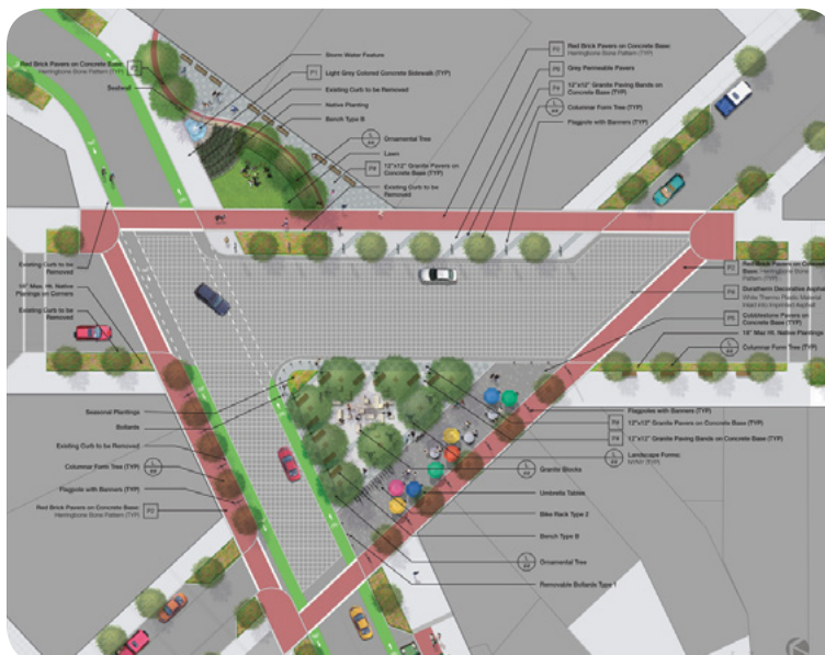
6-points Intersection Plan